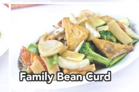
Family Bean Curd