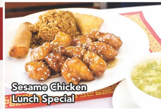
Sesame Chicken Lunch Special

Available everyday from open to 3:00 pm including weekend and holidays. Served with fried rice, soup of the day, an egg roll and a crab puff.