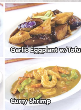
Garlic Eggplant w/Tofu