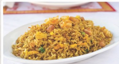
Singapore Fried Rice