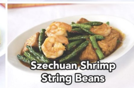
Szechuan Shrimp String Beans