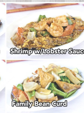
Shrimp w/Lobster Sauce