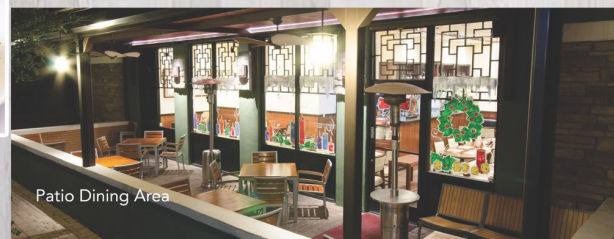
Patio Dining Area

Great selection of Wine and Beer available