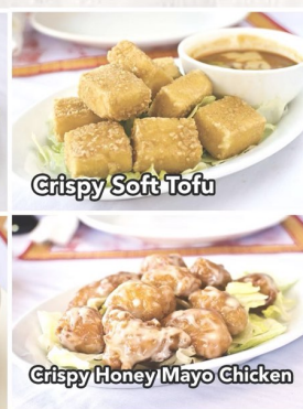
Crispy Soft Tofu