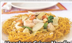
Hongkong Crispy Noodle