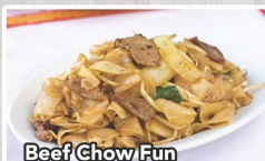
Beef Chow Fun