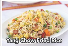
Yang Chow Fried Rice