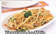
Vegetable Lo Mein

chicken, shrimp & vegetables in light sauce.