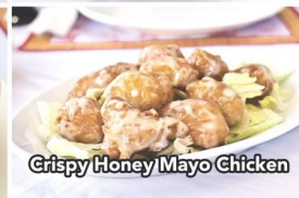
Crispy Honey Mayo Chicken