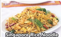
Singapore Rice Noodle