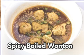
Spicy Boiled Wonton